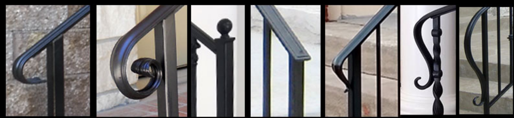
Standard Rolled Volute - Scroll volute - Ball cap only - Straight miter - Forged Lambstongue/small/med/large

*ITEMS NUMBERED WITH A "P" ARE POST CAP OPTIONS, ITEMS WITH A "F" ARE FINIALS FOR PICKET TOPPERS